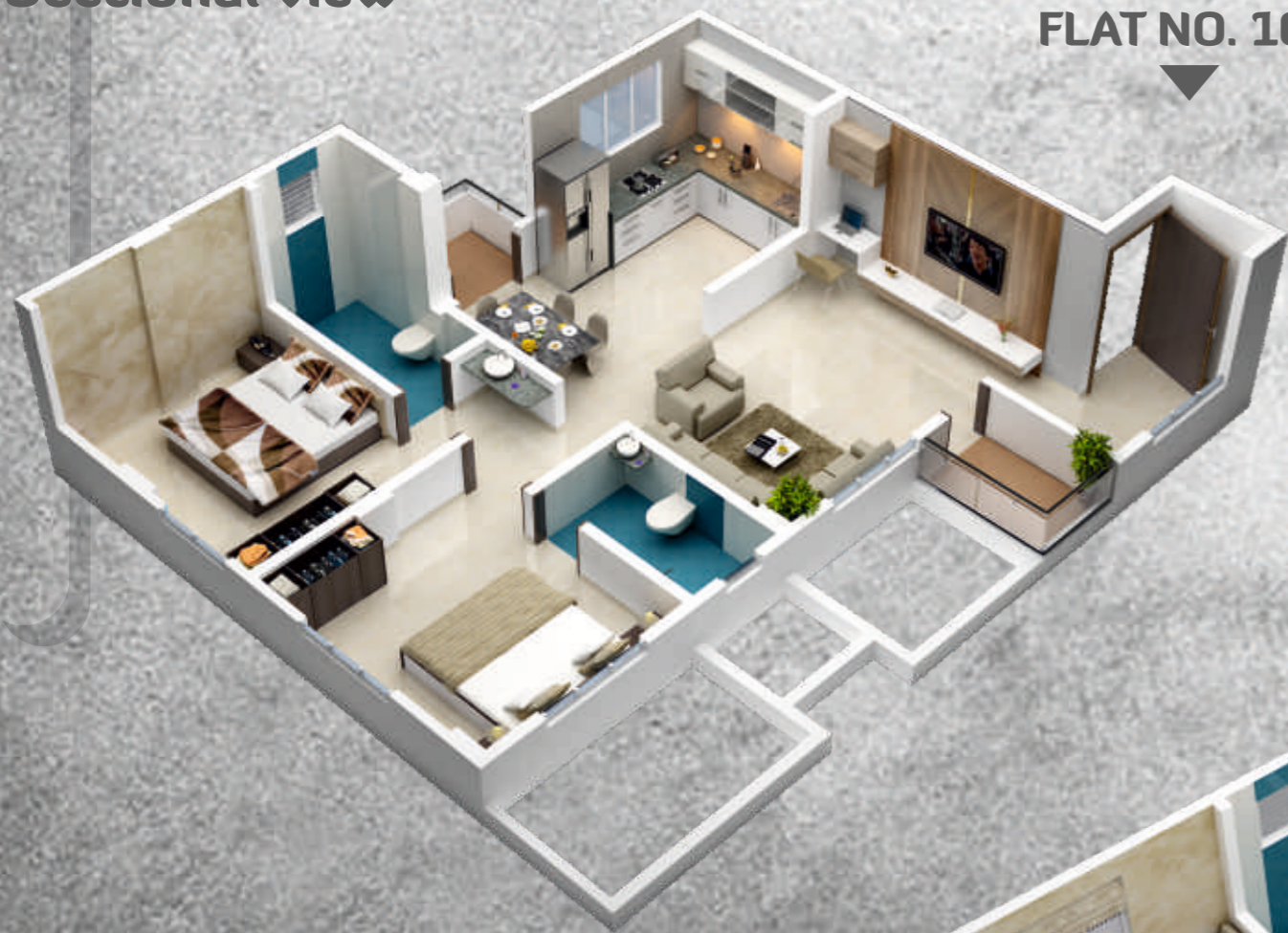
FLAT NO. 101