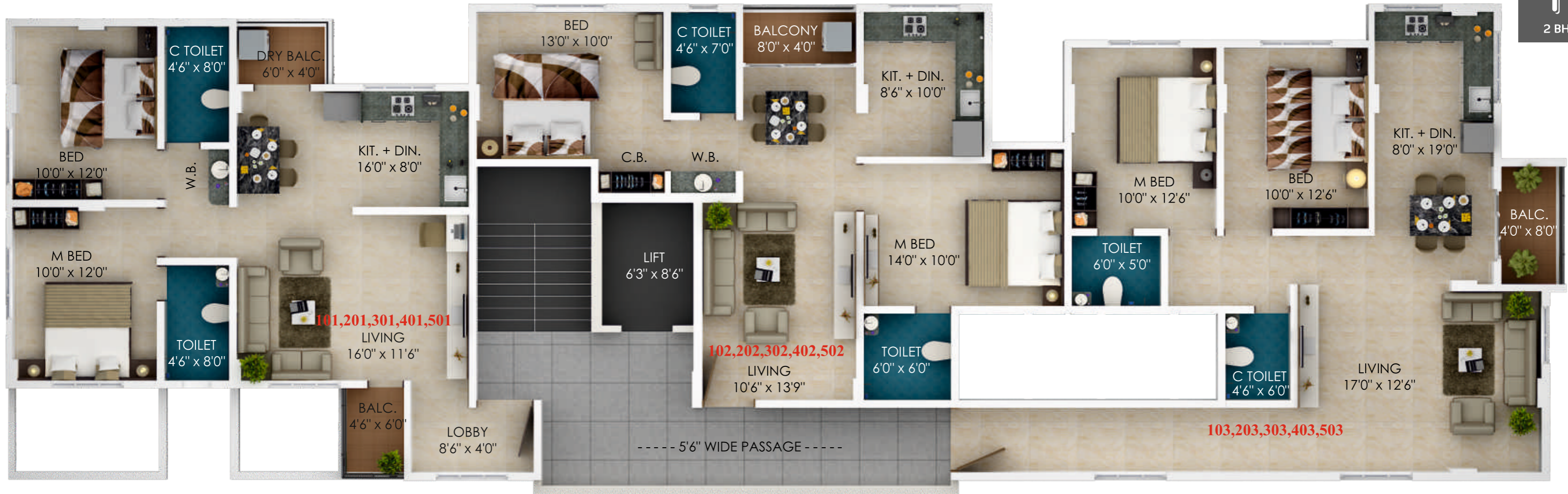
Mithila - Typical Floor Plan