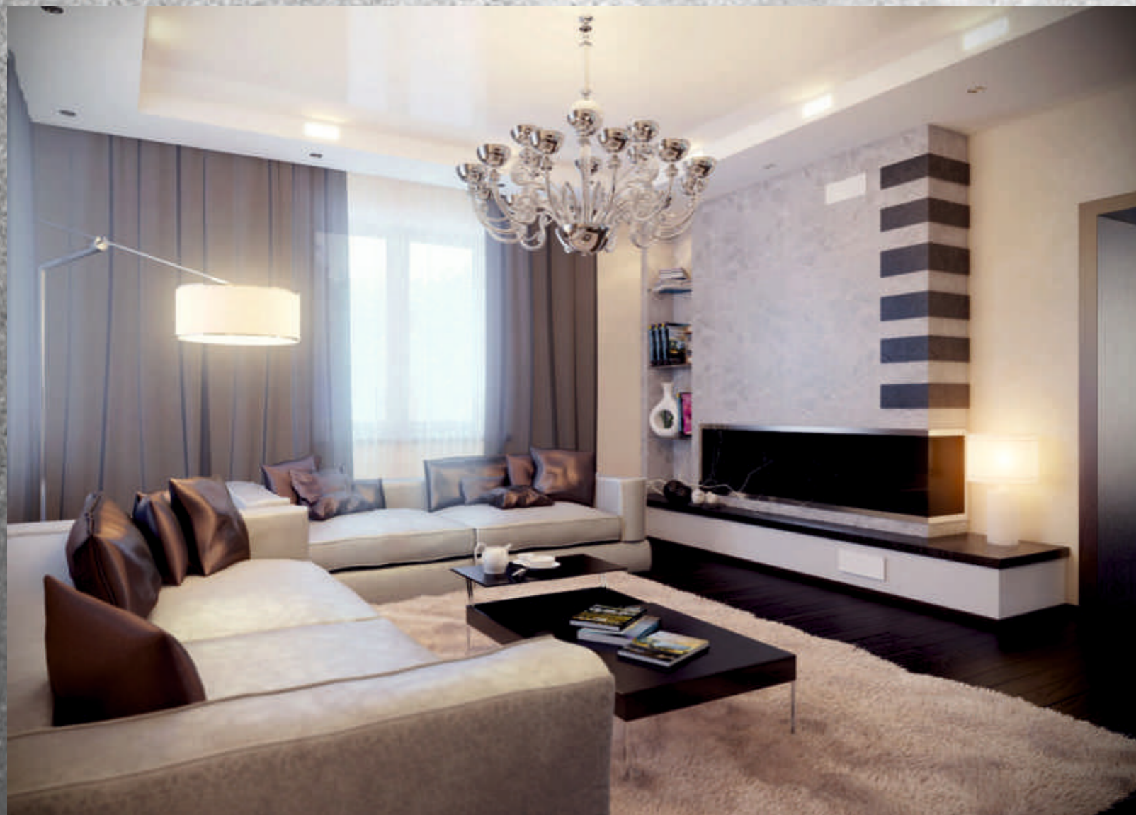
~ Usability and Friendly Interiors ~

Without a doubt Mithila speaks to those who value design and space. Befitting a project dedicated to architectural excellence Mithila is encompassed with all engineering and technological features built to high standards.