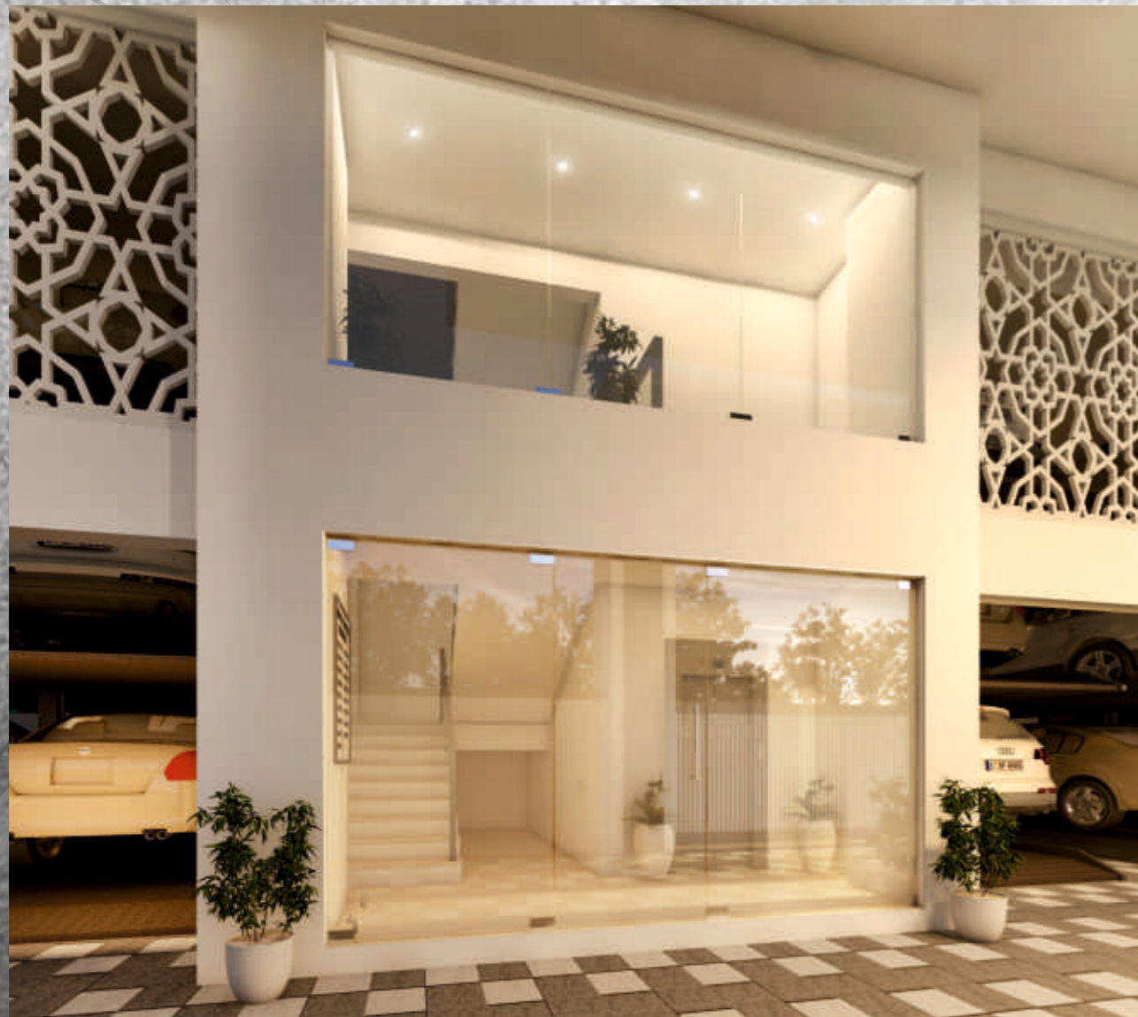
~ Designed Entrance Lobby ~

Style and quality distinguish Mithila from other players. The construction is modern and aesthetic, a masterful blend of eye-catching design and excellent execution. Sturdy and strong, but also subtle and suave. A special creation for the special people who will reside here. A glance at the amenities will convince you that we really care.